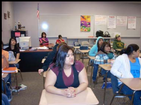
Parma High School