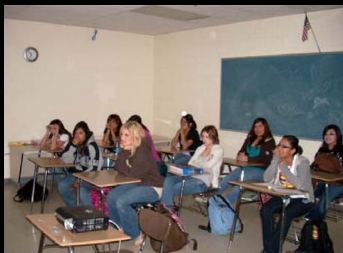
Wilder High School

On April 27th, the Idaho Meth Project partnered with COSSA (Canyon Owyhee School Service Agency) to present in elective health classes in Parma, Marsing, Homedale, Wilder and Notus. COSSA provides professional and technical training classes that would otherwise be financially impossible for these schools on their own.